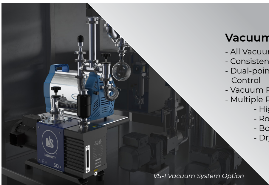
VS-1 Vacuum System Option