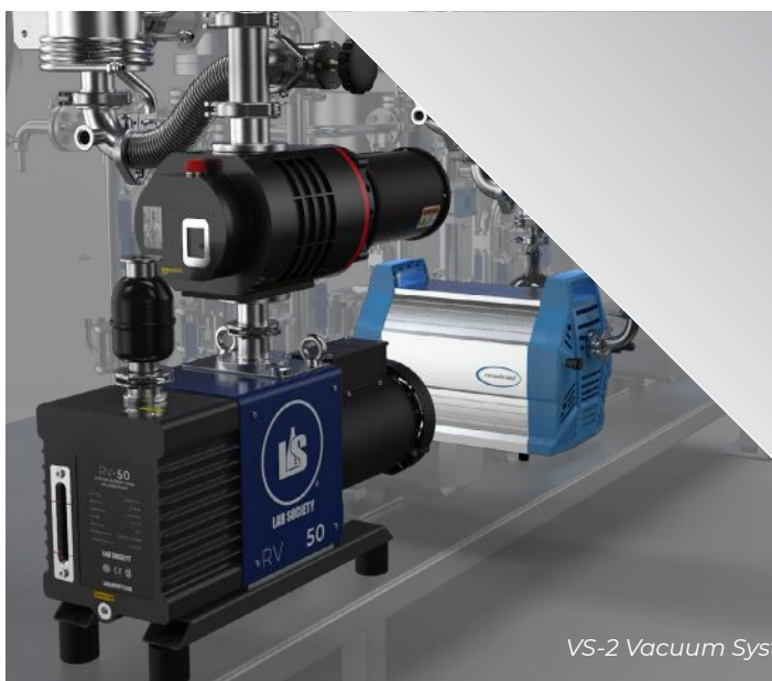
VS-2 Vacuum System Option