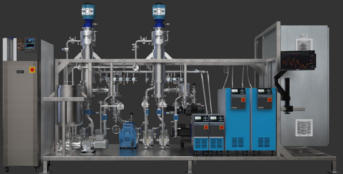
Closed-loop Chiller Option